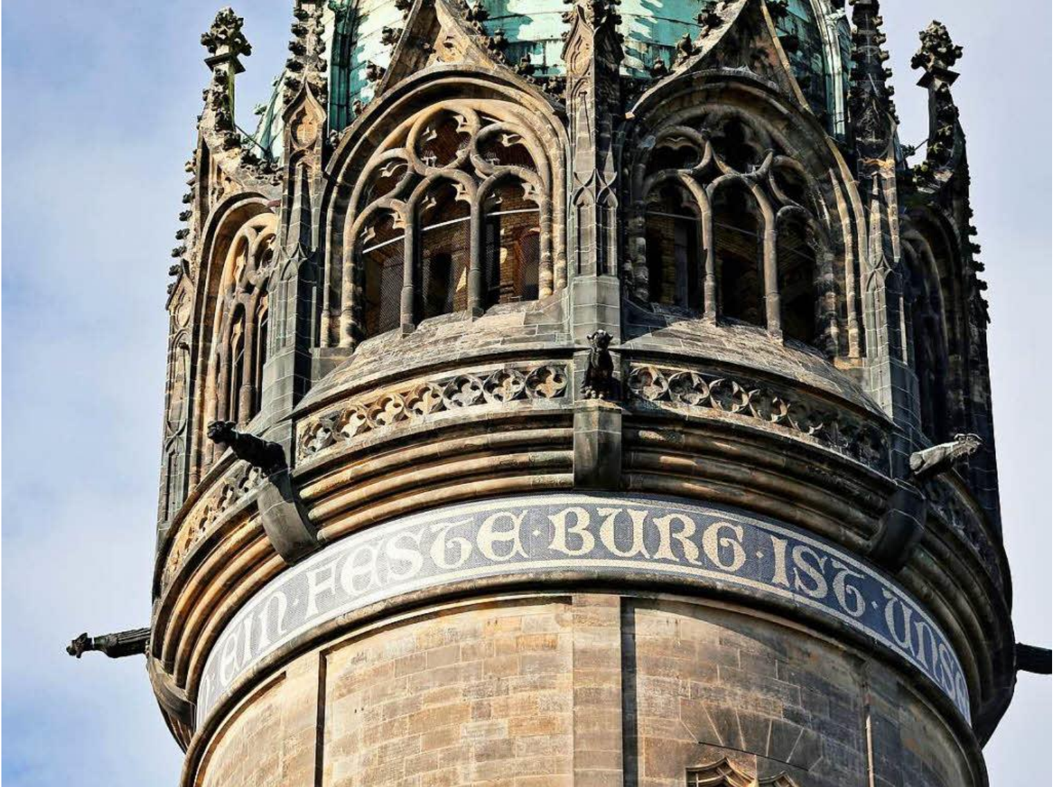
Castle Church (Schlosskirche) in Wittenburg, Germany

The title in German is "Ein Feste Burg Ist Unser Gott." It is inscribed in stone in two prominent locations. It is on the tower of Castle Church (Schlosskirche) in Wittenburg, Germany where Luther nailed his 95 theses, sparking the Protestant Reformation. And it is also inscribed on the front of the Georgenkirche in Eisenach, Germany where Johann Sebastian Bach was baptized and Martin Luther sang as a boy soprano and later preached his reforming doctrines while under papal ban.